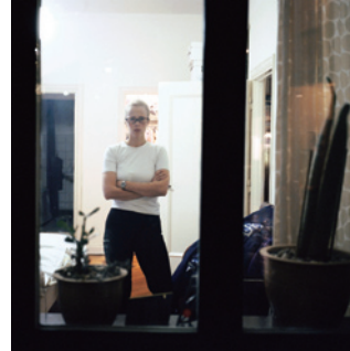
YOKOMIZO Shizuka Stranger (9) , 1999 C-print H108xW127cm (incl. frame) Collection of 21st Century Museum of Contemporary Art, Kanazawa ©YOKOMIZO Shizuka