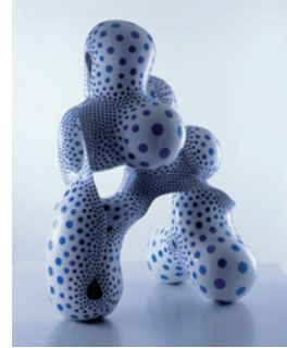
NAKASHIMA Harumi WORK-0703 , 2007 porcelain, coil making, inglaze, clear glaze H82xW61xD42cm Private collection ©NAKASHIMA Harumi Photo: SAIKI Taku (Reference image) Courtesy of gallery VOICE