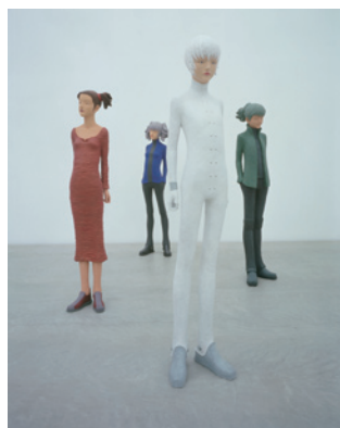
KITAGAWA Hiroto New Type 2005 – white H171 x W36 x D32 cm New Type 2005 – dress H168 x W34 x D28 cm New Type 2005 – green H171 x W38 x D44 cm New Type 2005 – blue H170 x W42 x D30 cm 2005 terracotta, acrylic paint Collection of 21st Century Museum of Contemporary Art, Kanazawa © KITAGAWA Hiroto