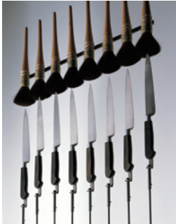
Rebecca HORN Eight Branches of Hair on Fire (detail) , 1993 eight knives, eight brushes, metal construction, motor H235xW49xD29.5cm Collection of 21st Century Museum of Contemporary Art, Kanazawa ©Rebecca HORN