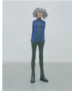
KITAGAWA Hiroto New Type 2005 - blue , 2005 terracotta, acrylic paint H170xW42xD30cm Collection of 21st Century Museum of Contemporary Art, Kanazawa ©KITAGAWA Hiroto